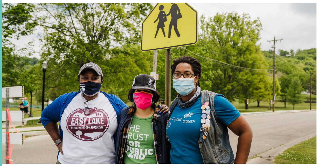
East Lake Neighborhood Association and The Trust for Public Land volunteers at the East Lake neighborhood intersection improvement demonstration project.

Landfill – The trail between Southside Community Park and Chattanooga Creek will traverse over a capped landfill owned by the City of Chattanooga. This landfill will require additional construction and geotechnical considerations, particularly in minimizing the trail cut and placement of boardwalk piers to avoid the underground landfill material, which is expected to be feasible.