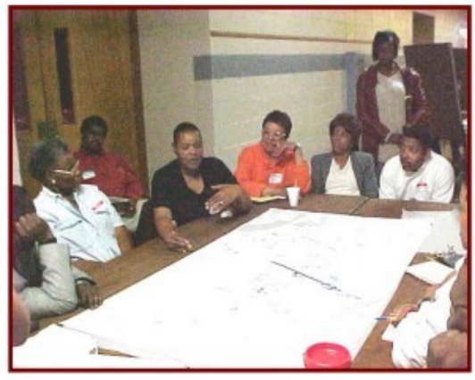
Community meeting in 1999 as part of the 2000 Alton Park Master Plan