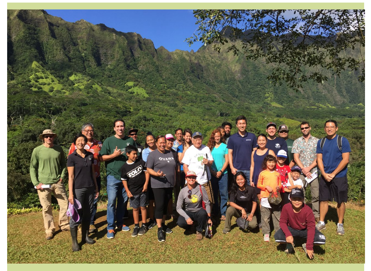
Kāne'ohe community leaders, State DLNR staff, land trust staff, farmers, elected officials, and keiki gather to learn about and plan for the future of the lands behind them.