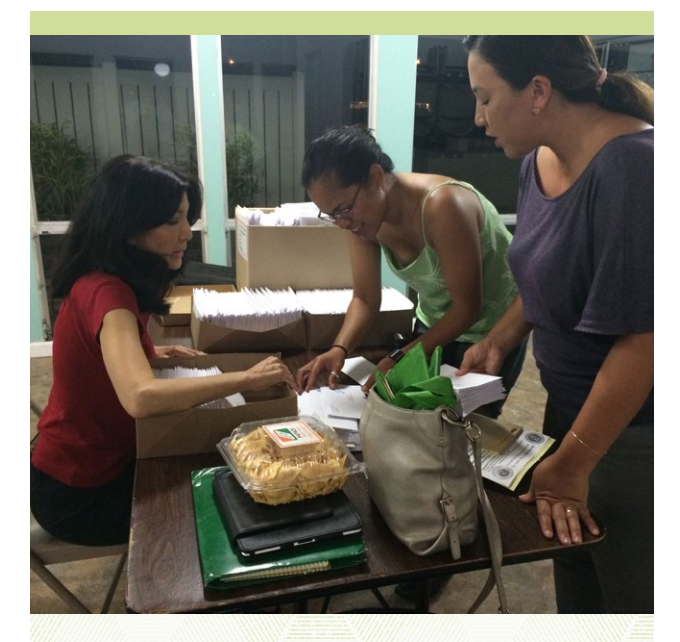
Ka Iwi Coalition volunteers and land trust staff work into the night to mail requests for the last funds needed to complete Ka Iwi Coast's protection.

• What is the total fundraising need (including costs of the fundraising campaign)?