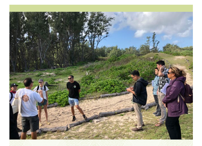
At Kalaekauna'oa or Kahuku Point on O'ahu's North Shore, North Shore Community Land Trust, partners, funders, and elected officials join a site visit to learn about the native restoration efforts.

However, community members should be keep in mind that land trusts and community groups are separate entities with their own decision-making processes. Land trusts can work with and provide community groups with information, and make recommendations or suggestions, but land trusts do not make decisions for the community. By the same token, land trusts have their own by-laws and