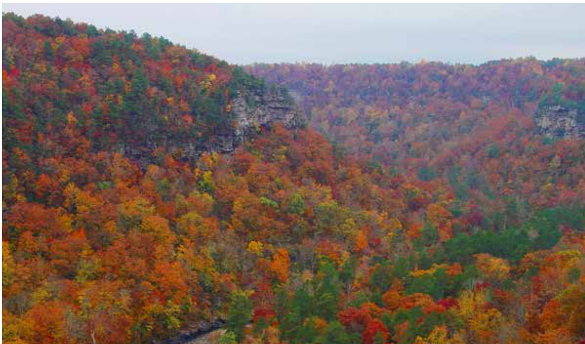
NATIONAL PARK SERVICE

Tourism spending in Alabama supported 176,000 jobs in 2015. This represents a 5 percent increase from 2014 and 9 percent of all nonagriculture employment in the state. The majority of direct travel-related employment (73 percent) is supported by lodging facilities and eating and drinking establishments. The state's General Fund received $46.8 million from lodgings taxes in 2015, and the total state and local tax revenues generated by travel and tourism activities represented $424 in savings per household on municipal services. 39 Meanwhile, outdoor recreation generates $7.5 billion in consumer spending and $494 million in state and local revenues each year. 40 This spending directly supports 86,000 Alabama Jobs associated with $2 billion in wages in salaries. 41