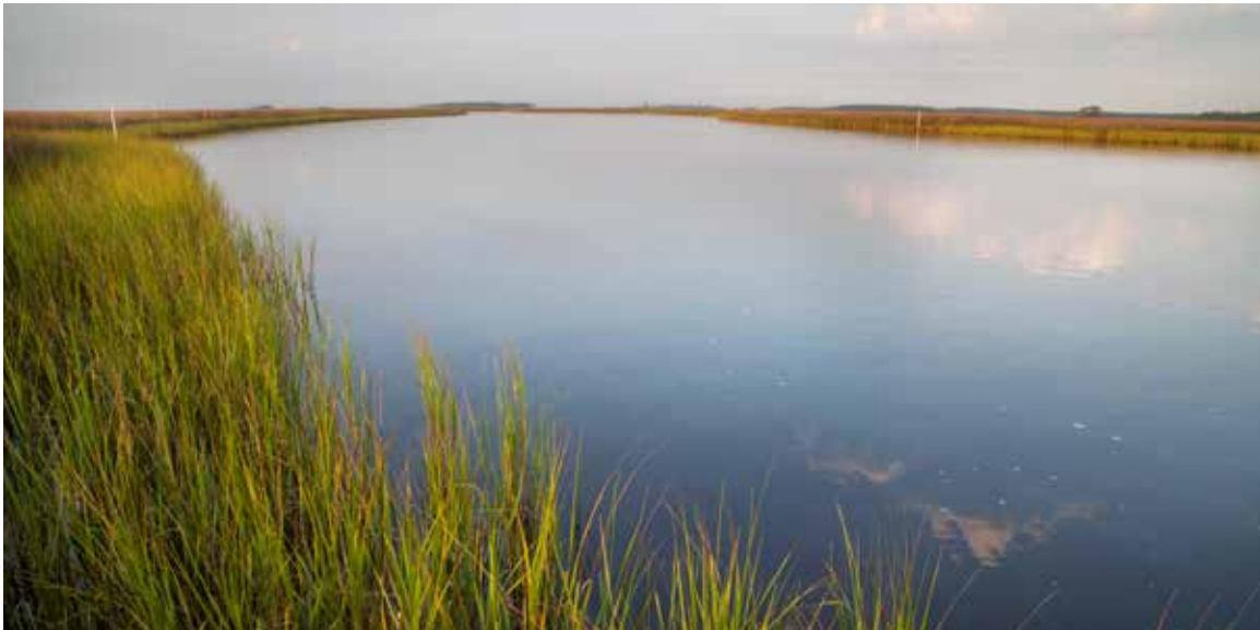
BETH MAYNOR YOUNG

From 1994 to 2015, Alabama funded the conservation of 188,000 acres, including lands protected through fee simple acquisitions (i.e., lands purchased outright from willing sellers). 5 During this time, an average of 8,540 acres were protected annually through state spending, using an average of $8.26 million each year (this is nominal spending, i.e., not in today's dollars). The average expenditure per acre conserved during this period was $968. Table 1 breaks out the dollars spent and historical acres conserved by Forever Wild.