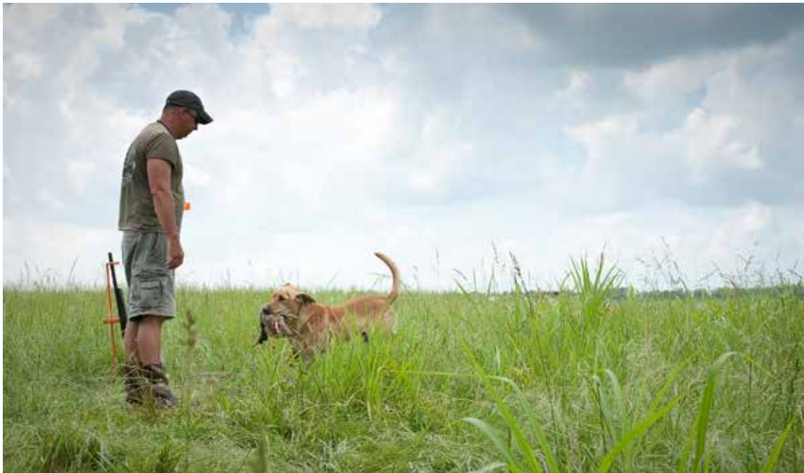
ALABAMA DEPARTMENT OF CONSERVATION AND NATURAL RESOURCES

Alabama ranks seventh in the country in the number of resident hunters, of whom there were 492,000 in 2011. 47 Hunting by Alabama residents and nonresidents generates a substantial economic impact. For example, resident and nonresident hunters in Alabama spent $913 million in 2011. 48 All hunting activities in Alabama support 27,300 jobs, produce $613 million in wages, and generate $104 million in state and local taxes. 49 Conservation lands play an important role in supporting this industry by providing areas for hunting to take place. For instance, a 2016 survey of 12,800 Alabama hunters found that 13 percent of hunters in Alabama primarily hunt on public land. 50