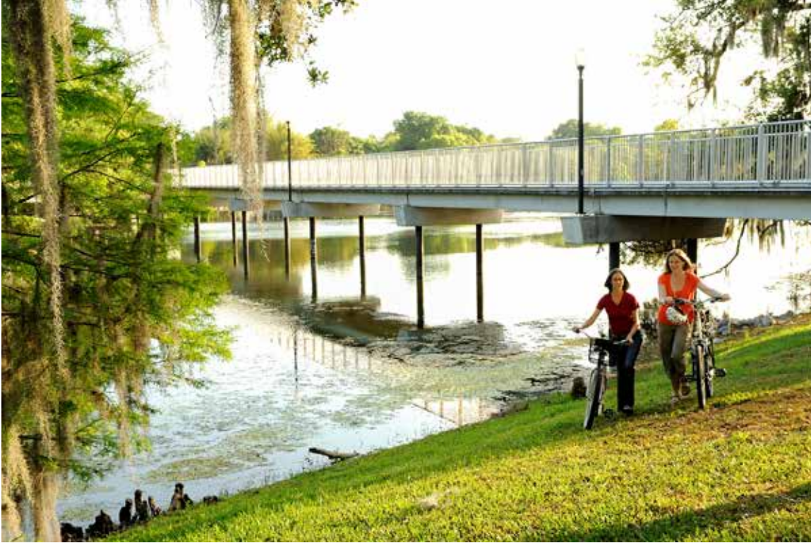
Two women walk their bikes in a park along the Orlando Rail Trail in Orlando, FL.

By providing valuable green space and recreational amenities, such parks are critical to the quality of life in dense communities. In this way, parks can facilitate a reduction in GHG emissions by alleviating some of the drawbacks of dense development (reduced private green and recreational space, increased air pollution, decreased water quality, etc.), thereby allowing more people to comfortably live in dense, mixed-use communities. On a society-wide scale, these benefits can be enormous (Ewing, et al., 2008), but the indirect relationship between parks and