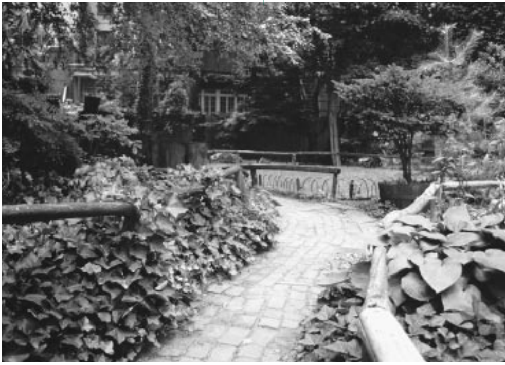
Parque de Tranquilidad Lower East Side, Manhattan