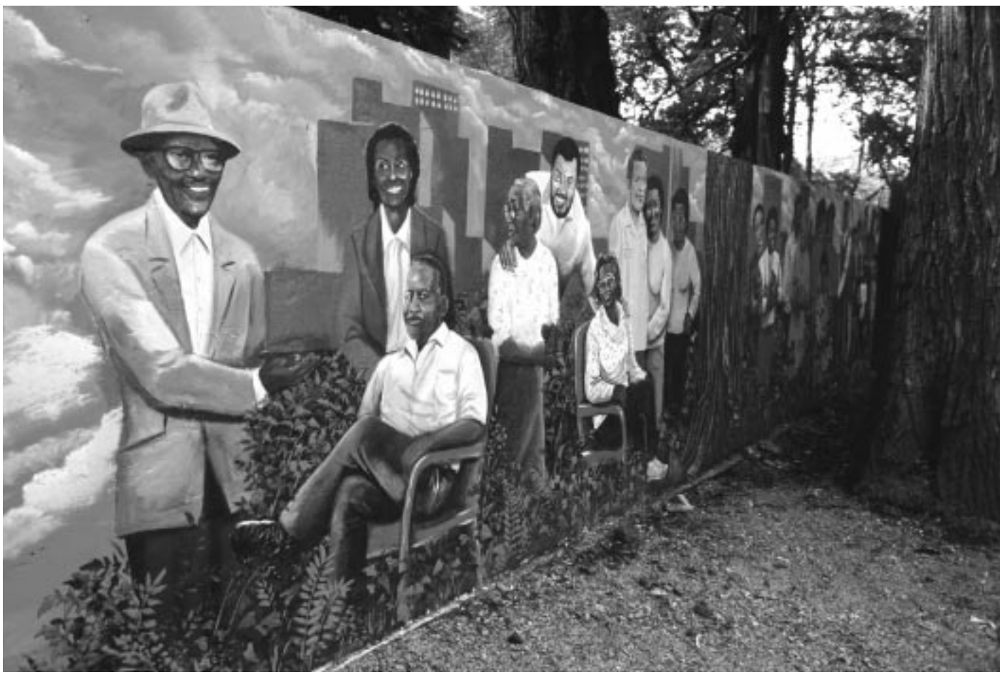
Classon Ful-Gate Block Association Garden Bedford-Stuyvesant, Brooklyn