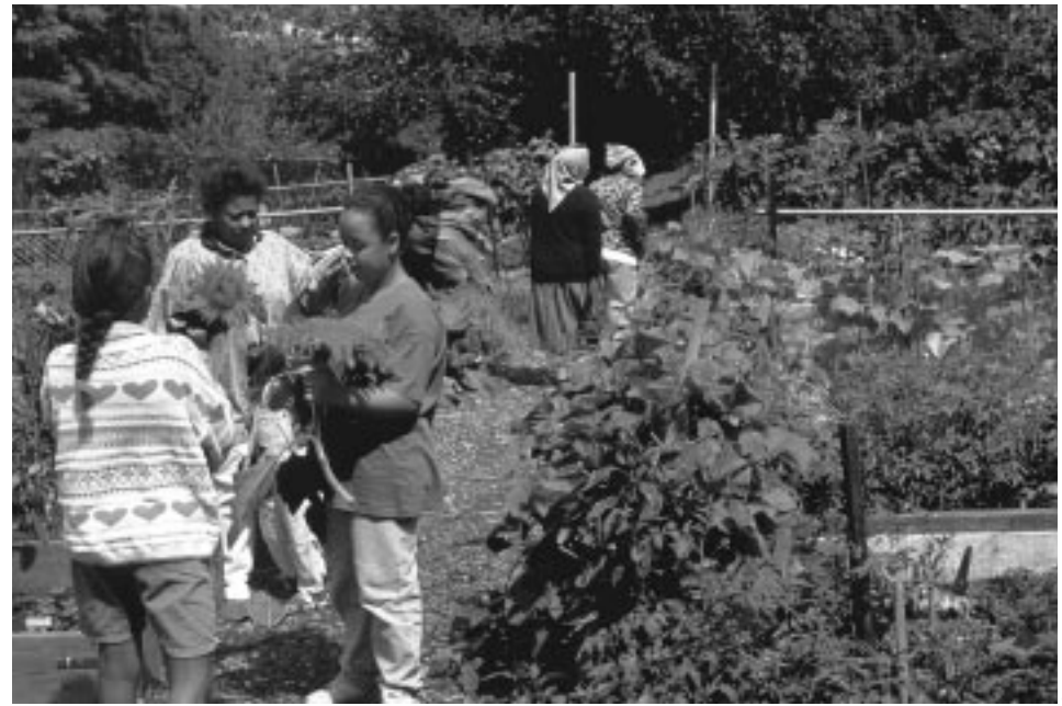
Riverside Valley Community Garden - West Harlem, Manhattan

Gardens provide a natural and irresistible focus for neighborhood activities. A garden bench becomes a spot for a casual conversation. Weddings, block parties, crime-