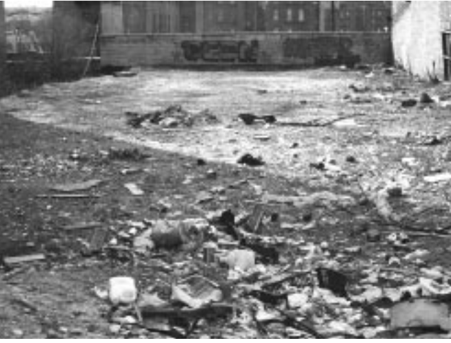
Unity Place - South Bronx

Transforming a filth-filled empty lot into an orderly garden, and then into a vibrant community resource, requires imagination, determination, and hard work.