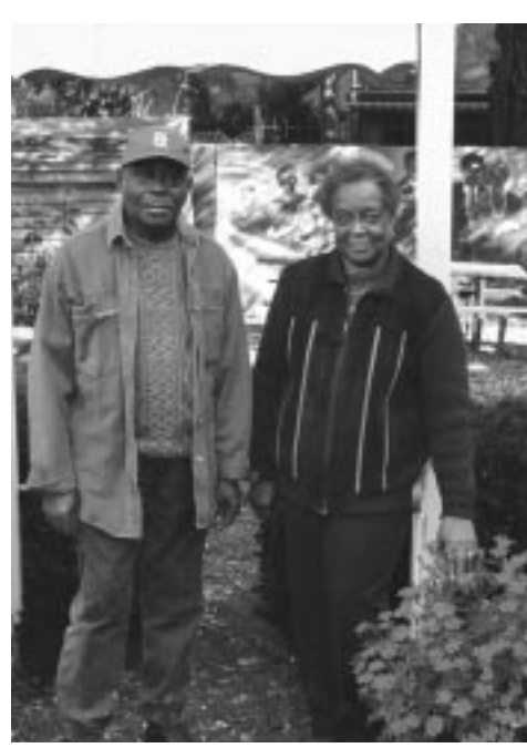
Classon Ful-Gate Block Association Garden Bedford - Stuyvesant, Brooklyn

Just as Manhattan's restored Bryant Park has changed the image of its surroundings, so a good community garden can create a new, positive image for a neighborhood.