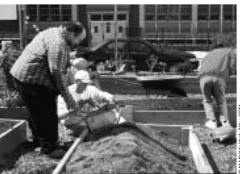
IS 318/Project Roots Garden - Williamsburg, Brooklyn

In the face of this need and the many benefits gardens bring a neighborhood, the auctioning of gardens does not make economic sense. The gardens proposed for auction in 1999 constituted only about 1 percent of the city's 10,000 vacant lots. Their economic value was minuscule in the context of a 1998 city budget of $34 billion, which included a $2 billion surplus. And since the ultimate productive use of the land is not guaranteed, new uses may or may not offer continuing contributions to the tax base. Finally, most gardens are in areas of the city where property values and tax rates are low. The money the city might gain in auctioning gardens is therefore negligible compared to the value they bring as open space.