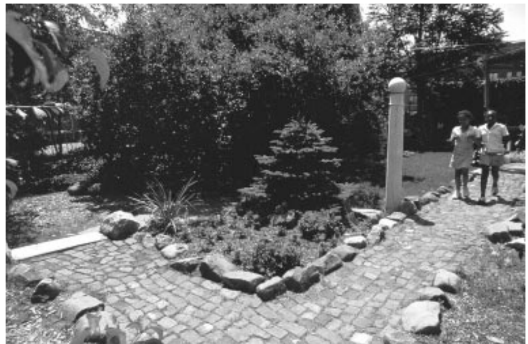
Howard Avenue Garden - Brownsville, Brooklyn