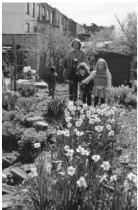
Garden of Union - Park Slope, Brooklyn