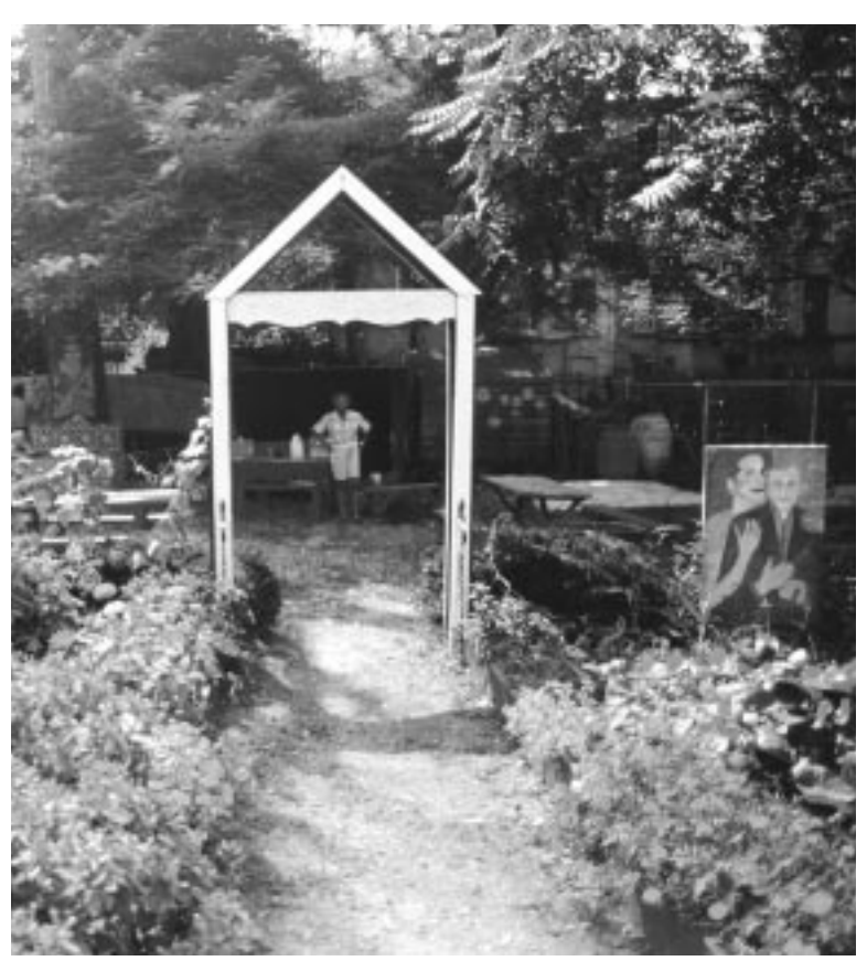
Classon Ful-Gate Block Association Garden Bedford-Stuyvesant, Brooklyn

As New York City cultivates new industries to replace manufacturing, it is critically important to increase the attractiveness of a wide range of neighborhoods. The city must accommodate skilled workers who cannot afford the exorbitant rents in Manhattan and therefore look to the other boroughs for their