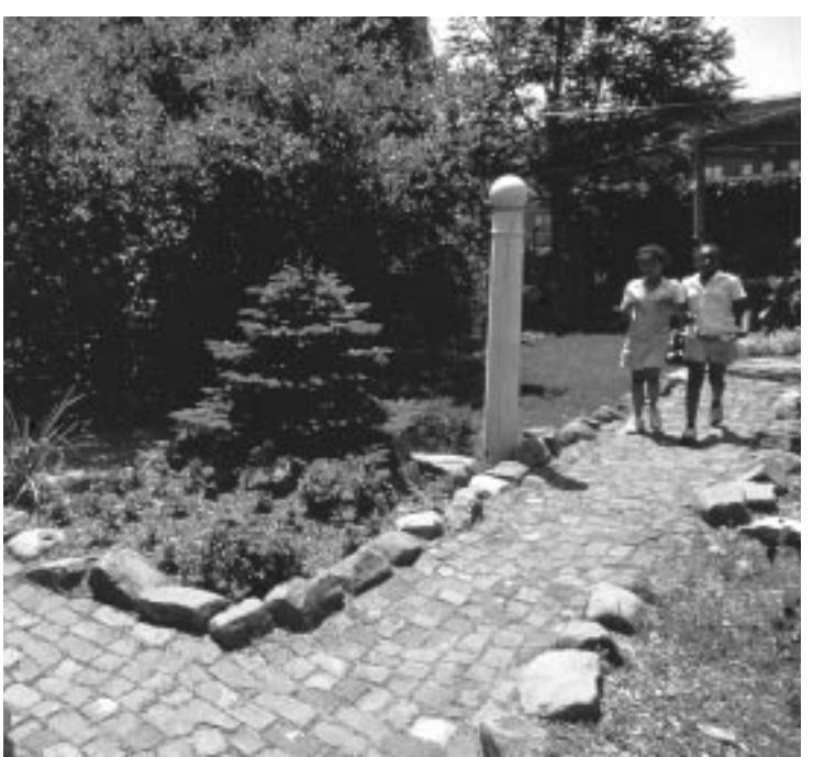
Howard Avenue Garden - Brownsville, Brooklyn

Similar evidence comes from other gardens. In the Holly Park neighborhood of Seattle, a resident comments that he used to hear gunshots many times."[There were] gangs . . . lots of garbage and bottles. But since a community garden filled a vacant lot, the gangs have moved and crime has gone down."<sup>35</sup> And in Philadelphia, burglaries and thefts in one precinct dropped by 90 percent after police helped residents clean up vacant lots and plant gardens.<sup>36</sup>