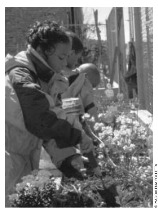
IS 318/Project Roots Garden - Williamsburg, Brooklyn

Other gardens, while not formally linked to schools, make an obvious difference in the lives of children: