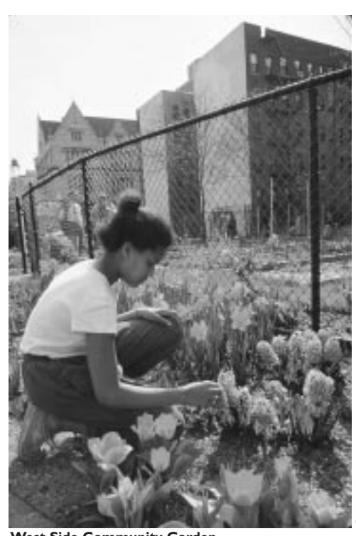
West Side Community Garden Upper West Side, Manhattan

Revitalization of city-owned lots as community gardens also has yielded dramatic positive effects for communities and should be promoted as a focus of public policy.