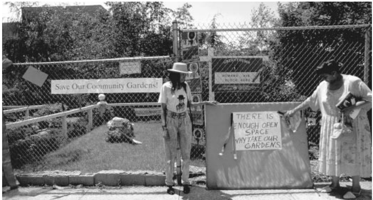
Howard Avenue Garden - Brownsville, Brooklyn

As the conflict between housing and open space becomes more real through increasing density, the need for open space becomes even greater.