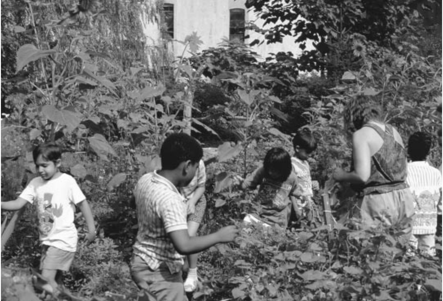
6th Street & Avenue B Garden - Lower East Side, Manhattan