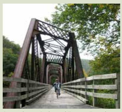
Pennsylvania Parks and Forests Foundation

Money provided by the Keystone Fund rehabilitated several beautiful bridges over the creek and contributed to some of the mundane but nevertheless vitally important features of this long trail—it also paved the parking lots and installed the SSTs ("sweet smelling toilets"). All it takes to understand the importance of this spending is to read comments and reviews on the Rails-to-Trails Conservancy (RTC) website for trails across the country. If these facilities aren't in place, trail users are not happy. And when it comes to the Pine Creek Rail Trail, the users are happy!