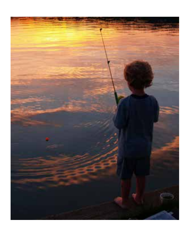
Exhibit 4. Participation in Wildlife-Associated Recreation in Pennsylvania–2011 (Residents and Nonresidents)

Conserved lands provide essential habitat for fish, game, and other species that attract visitors and sportspersons who spend money on equipment and trip-related expenses. Over 4.56 million people participated in at least one form of wildlife-associated recreation in Pennsylvania in 2011. Approximately 1.4 million people either hunted, fished, or did both, while nearly 3.6 million people went wildlife watching. Participants spent significant amounts of money in local communities related to their activity. In 2011, nearly $2.8 billion was spent on wildlife-related recreation. Wildlife observers spent $1.23 billion while hunters and anglers spent a combined $1.56 billion. About a quarter of all spending was on trip-related (travel) expenses. See Exhibit 4 for a detailed breakdown of spending.