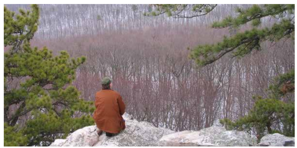
Pennsylvania Land Trust Association

This report quantifies and characterizes the economic benefits provided by Keystone projects in the above categories. We discuss a variety of benefits, including natural goods and services, tourism and visitor spending, job creation, community revitalization, business attraction, property values, fiscal impact, and others. Our findings indicate that the Keystone Fund provides an exceptional economic return on investment to Pennsylvania.