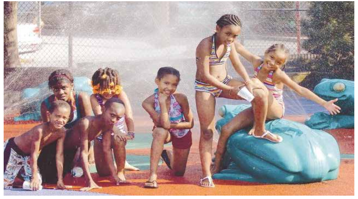
West Chester Borough

The Keystone Fund is a critical funding source for creating and protecting the places, amenities, and institutions that make Pennsylvania a great place to live and work. Open space, parks, trails, and important cultural assets contribute to a stellar quality of life while stimulating economic activity across the state. This study found that for every $1 invested in land and water conservation through the Keystone Fund, the State of Pennsylvania will receive a return of $7 in economic value of natural goods and services. In addition to that return on investment, residents, communities, and local governments benefit from new jobs and businesses, increased tourism, enhanced property values, revitalized neighborhoods, improved community fiscal health, natural goods and services, and more. By supporting the Keystone Fund, the state will continue to generate substantial economic benefits for the people of Pennsylvania.