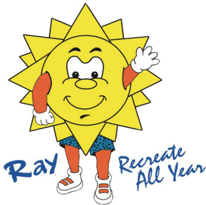
Mecklenburg County Parks and Recreation

New York City’s Department of Parks and Recreation uses both approaches. The agency has a 150,000-person email database but supplements its online advertising with print media (although recent budget cuts reduced direct-mail funds from $100,000 to $50,000). The department has attempted to compensate by launching “BeFitNYC,” a website and search engine that enables people to find facilities locations and program activities. The site was viewed 140,000 times in the first two months of 2010.