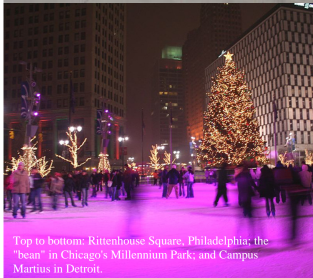
Top to bottom: Rittenhouse Square, Philadelphia; the "bean" in Chicago's Millennium Park; and Campus Martius in Detroit.