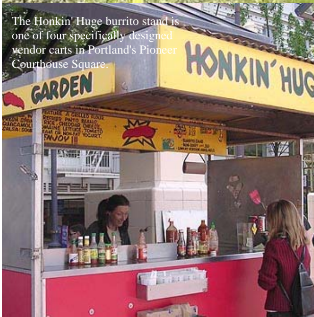
The Honkin' Huge burrito stand is one of four specifically designed vendor carts in Portland's Pioneer Courthouse Square.

Arts & History. Signature downtown parks are usually pieces of history themselves or are built atop land rich in city history, and the features of parks reflect this. Pioneer Courthouse Square features the entrance columns of the former hotel that graced the site. As central locations of civic activity, the parks also feature symbolic public art or statues. Pioneer Courthouse Square