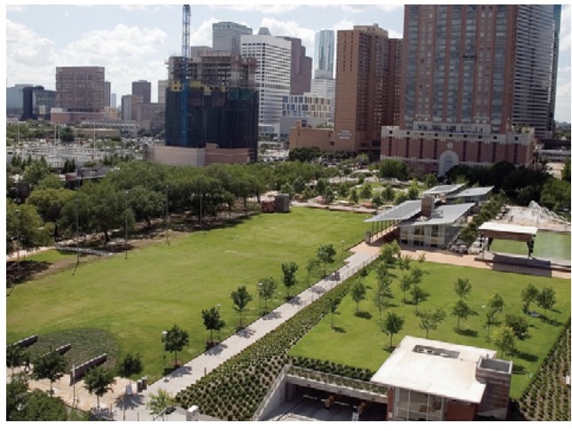
Since its 2008 completion over an old railway yard, Houston's Discovery Green has rocked the city's development assumptions, in part by spurring the first downtown residential high-rise building in five decades.

Realizing that a park could be a powerful anchor for a revitalized neighborhood, a group of philanthropists formed a task force to acquire the entire site. The newly elected mayor, Bill White, jumped on board, agreeing to donate two huge city-owned parking lots and a section of road—a total of 5.5 acres—and to contribute some funds toward the purchase of the rest of the 12-acre site.